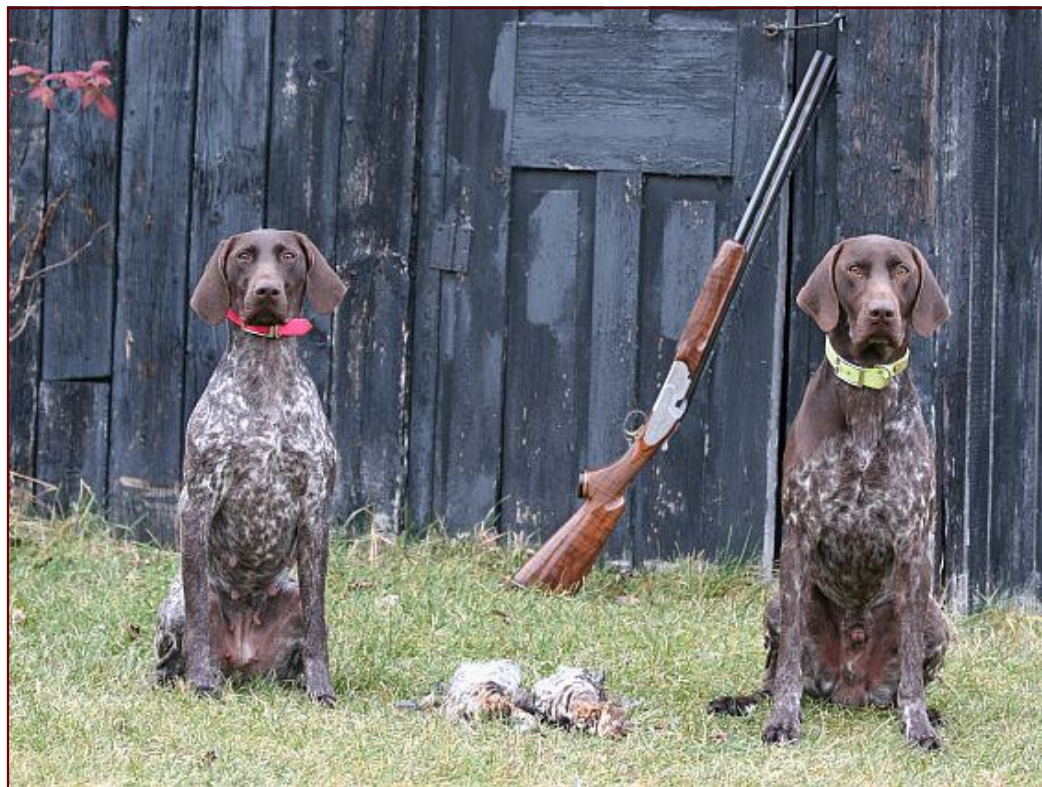
Left: Zyka vom Osterberg Right: Vito vom Osterberg