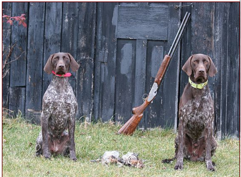
Grouse Hunters: Zyka vom Osterberg Vito vom Osterberg