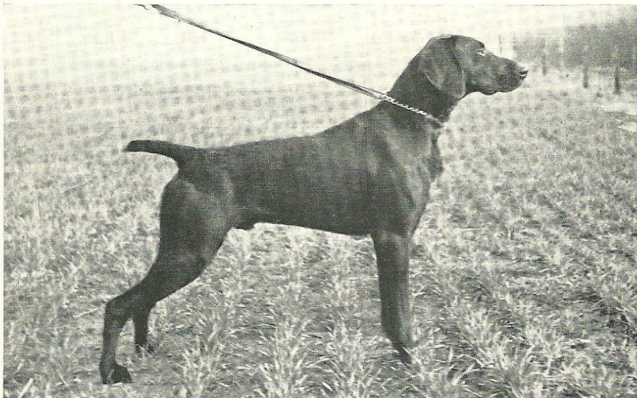
Axel vom Wasserschling 685 I / 59 DI m. S.